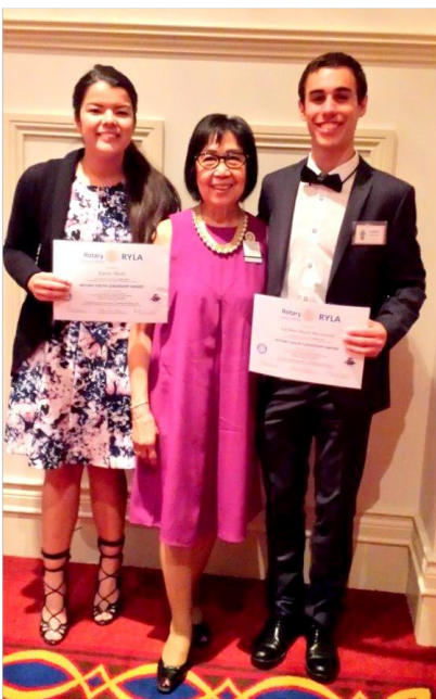
SIONY & RYLA GRADUATES