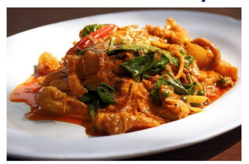
wrice and pappadum $13.90 - members $12.90