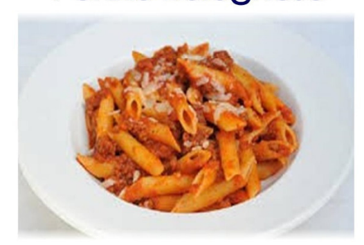
tossed in a traditional tomato & meat sauce $11.90 - members $10.90