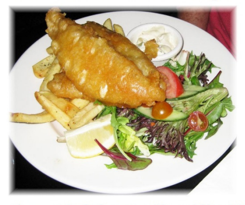
w home made dipping sauce, chips and side salad $13.90 - members $12.90