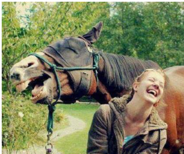
Towering Inferno in Happier Times