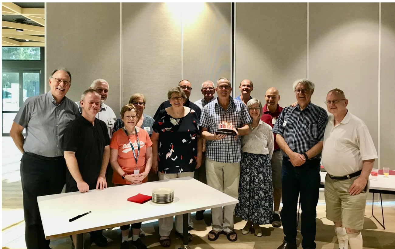
CELEBRATING MEETING 1,100 IN NEW LOCATION

In other words, why are you in Rotary ; something I am looking at running a promotional campaign around so watch this space.