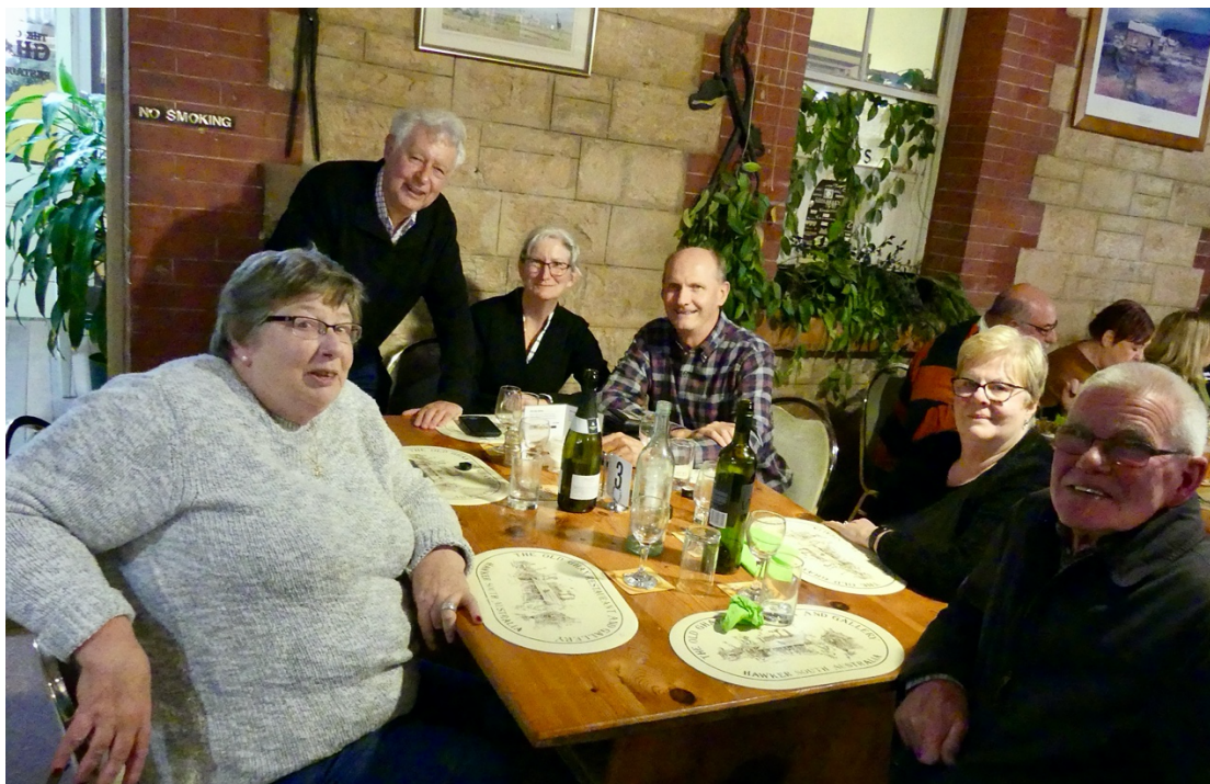
blowing off steam at Hawker

Well done Team Magill , well done RAWCS ,