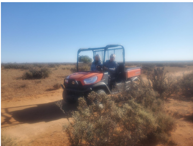
Suzette and Don Will on the RTV.

Ian and Suzette spent last weekend at Calperum Station , north of Renmark. Calperum is one of a handful of Biosphere Reserves in Australia . Rotary members from several Clubs across District 9510 joined together to support the environment research activities undertaken on the property. This weekend saw a new activity, measuring soil salinity . This involves digging lots of holes. Meanwhile Sue continued the measurement of water down a large array of boreholes around the three main lakes on the property. She was ferried around in the new Kubota RTV seen below.