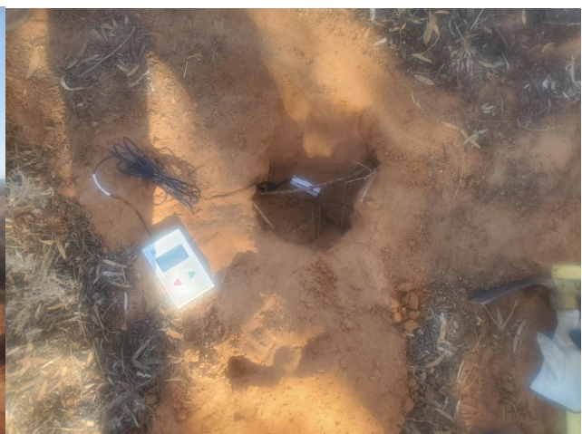
Lots of holes dug to measure soil salinity.

So, what's the end game with Calperum? Once we can fix the degraded land at Calperum, the same methods can be used throughout the Riverland on other degraded properties. Well done the Coats