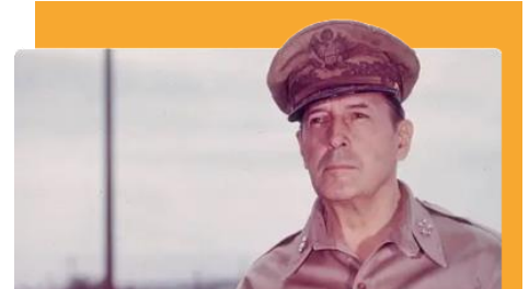
General Douglas MacArthur

"The last meeting of Rotary Club of Manila, the Philippines was held on the island of Corregidor on May 6, 1942, to induct Gen. Douglas MacArthur as an honorary member. Seven Rotarians conferred honorary membership on General Douglas MacArthur, in a dark tunnel amongst wounded soldiers, prior to the fall of Corregidor."