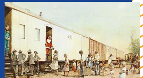
Left: Provision Store on the train