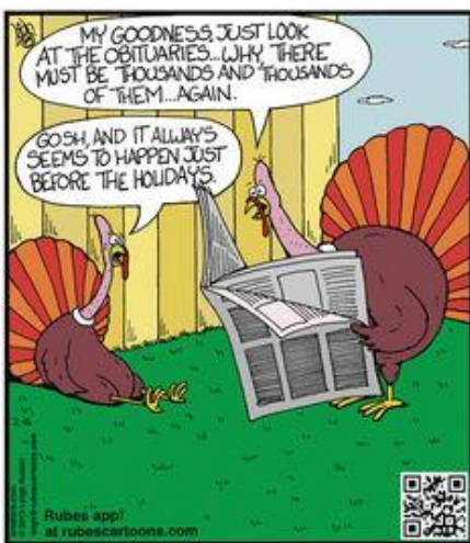
Turkeys without a clue