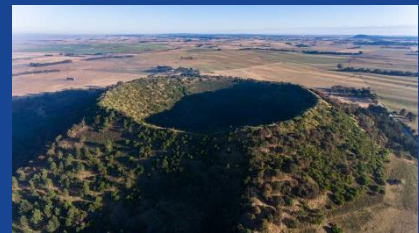
Mt Schank, SA