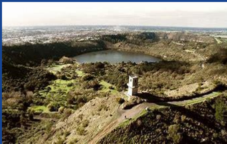
Mt Gambier, SA

Answer: Between Mt Gambier and Melbourne in Australia. Mt Gambier and Mt Schank are considered to be the most dangerous in the area.