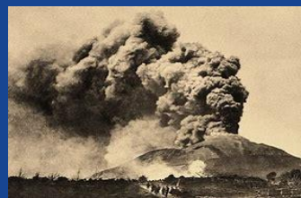
Mt Vesuvius 1906