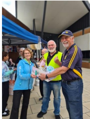
Announcing the win