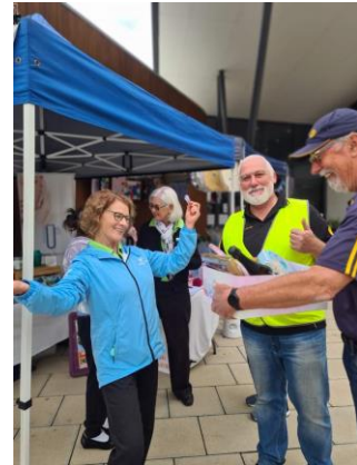
Presenting the Prize