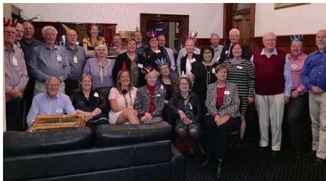
Past and present members at our 20 th Birthday in 2016

We are a small club but hit well above our weight, and we extend an invitation to those who wish to make a difference in this world to come and join us for a life changing experience that enables ordinary people to achieve extraordinary things.