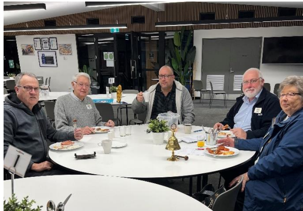
We threw a party and no one came

Well, I guess it's fair to say that this morning's meeting was a bit of a fizzer. Many things conspired to make it that way including pre-planned holidays and people being unwell, but worth a reminder that meetings are not optional – if you can attend, you should.