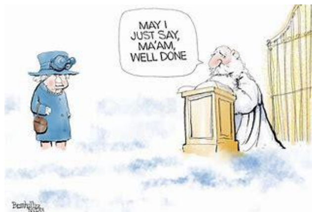
HRH Queen Elizabeth II - 1926-2022