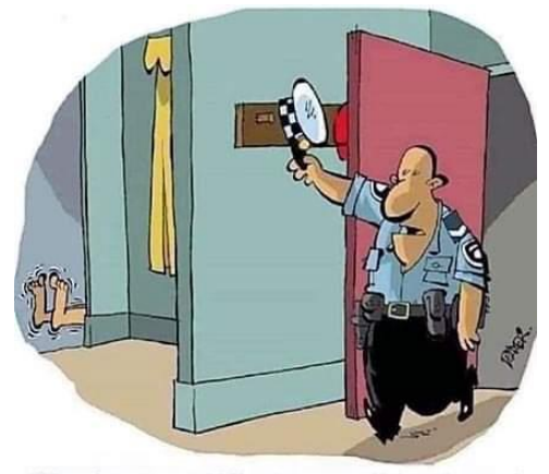
"I'm home...What a terrible day...I took your ladyshaver to work instead of my taser!"

October 28-30 ZONE 8 CONFERENCE CANBERRA National Convention Centre Canberra