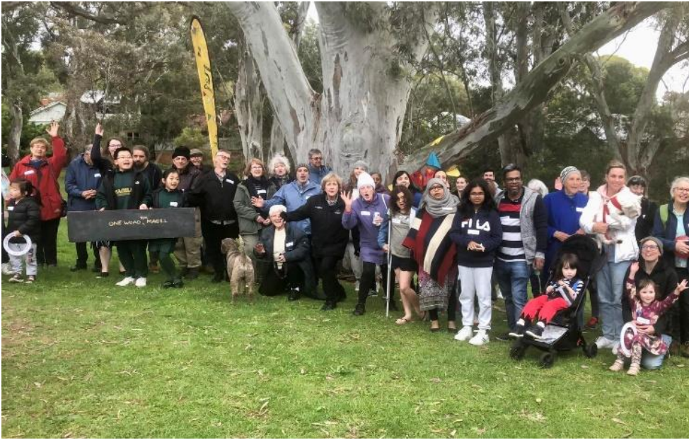
Magill residents at the Neighbourhood BBQ

We returned to Heccies for meeting #1199 which had a festive feel (with someone else's party decorations) and another good feed. It was certainly good to be back, see some familiar faces – and have two past visitors back to see us.