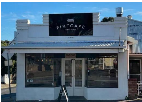
Pint Café, Magill

With so many of our members holidaying or away on other commitments, we almost cancelled meeting #1198 . However, a small but cheerful group took the opportunity to visit Magill Village, enjoying a coffee and hearty feed courtesy of Wade at Pint Café . Although the Café opened during Covid, it has survived and continued to grow through the roadwork disruptions.