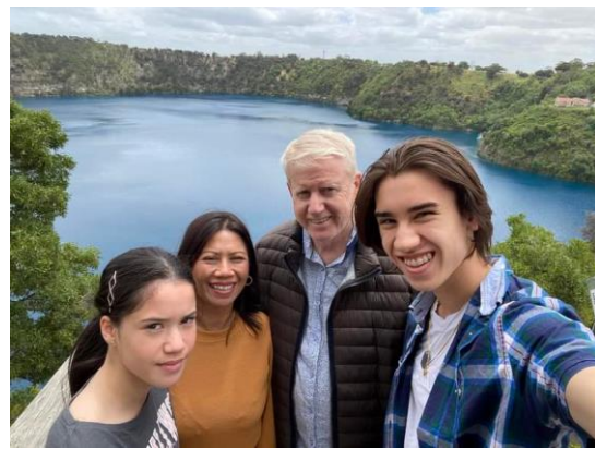
Flynn family on their SE holiday