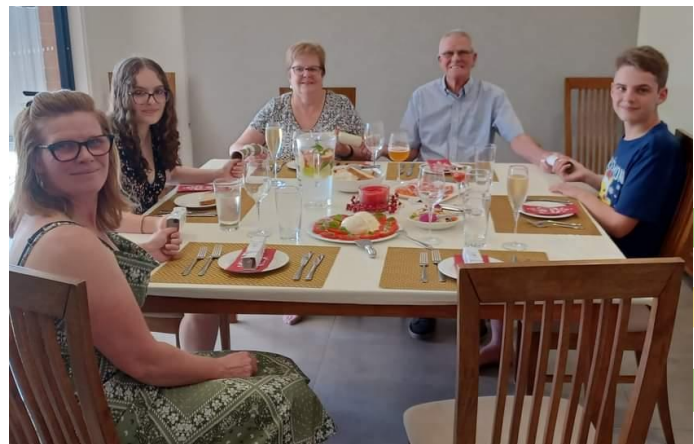
The Holcroft's delayed Christmas on New Years Day