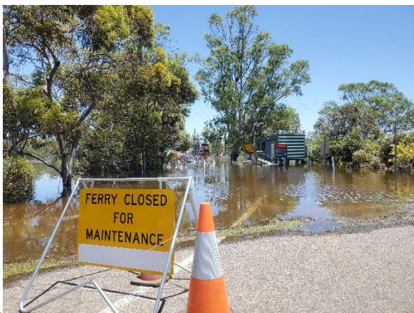
The Coats visited the flood damage along the Murray