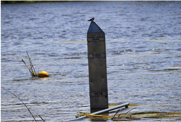
Brewer's at Renmark when the river peaked.