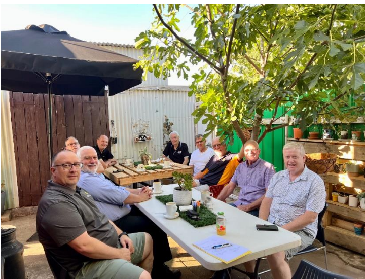
First meeting for 2023