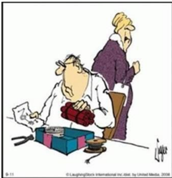
"Don't forget it's my mother's birthday tomorrow."