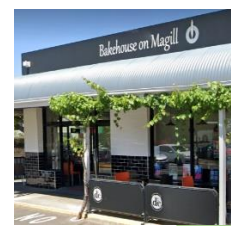
Bakehouse on Magill

Gift basket of fresh fruit and vegetabes