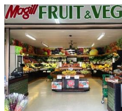
Magill Fruit & Veg