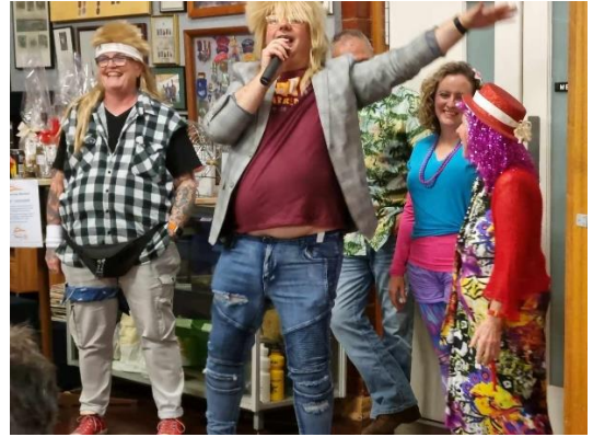
Judging the best dressed (women)