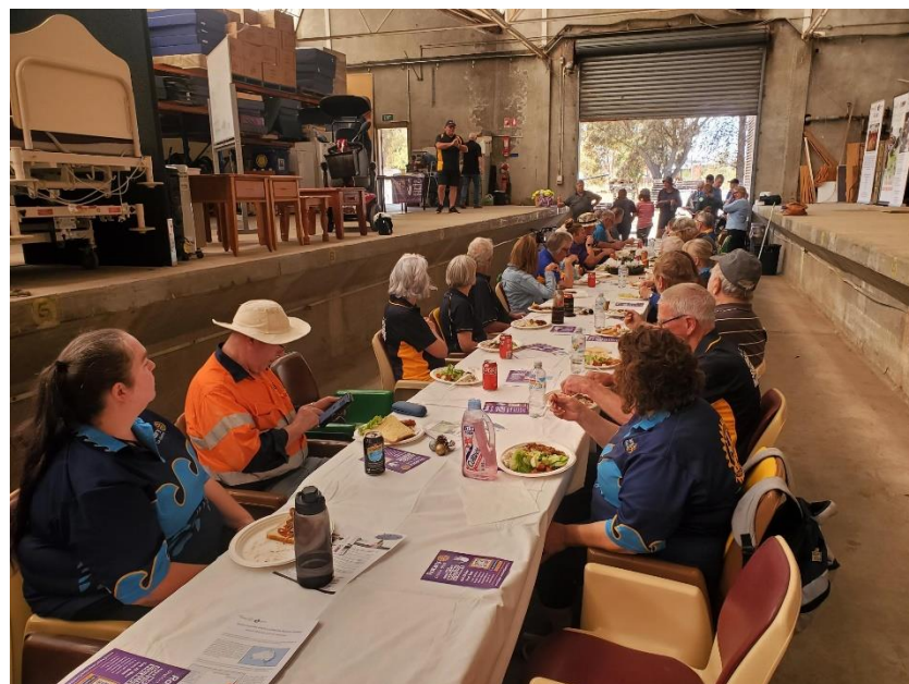
BBQ lunch at the RARE Working Bee