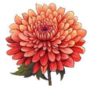
Market Roster - May 2026 (Mother's Day)

They are often associated with Mother's Day especially in Australia due to the affectionate term "mum" in the name.